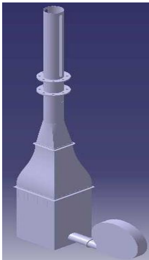
Figure 1. Schematic diagram of wind tunnel for terminal velocity measurement.

tions). The first part of flow straightener section consisted of a sufficient number of 10 cm long, 2 cm diameter tubes laid vertically above the fan so as to cover its entire cross-section. Two wire-mesh screens were laid above the co-axial mesh tubes. The second part of flow straightener section consisted of a sufficient number of 10 cm long, 0.6 cm diameter straws laid vertically below the pitot-tube and a wire-mesh screen was laid above the co-axial mesh straws. This setup provided a uniform velocity profile over the cross-section except near the wind tunnel wall. Figure 1 illustrates the wind tunnel and setup.