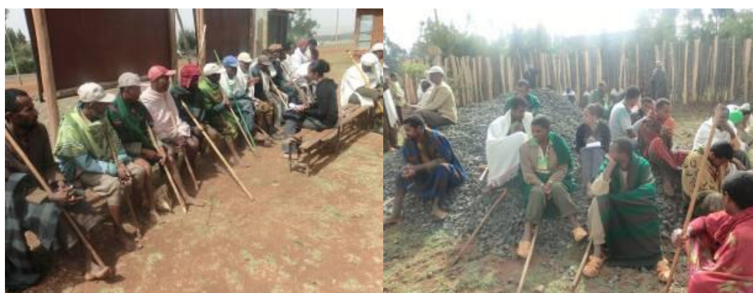
Figure 2. Focus group interview as research instrument (photo taken by first author, June 2012).

Undefined boundary between the extension service and the local politics is another reason for farmers' dissatisfaction. Farmers' said that there is clear discrepancy among extension service users to access training, frequent extension advices and agricultural inputs. Those who are mobilizing the community to support the ruling party get better access to services than ordinary farmers. This fact is well confirmed by previous literatures such as World Bank (2010) which indicated that politicians provide public services to clients in exchange for political advantage. Other studies by Cohen and Lemma (2011) and Berhanu (2014) also stated that the implicit goal in establishing uncontested monopoly over the Ethiopia's agricultural extension system is driven by the lust for obtaining legitimacy and acceptance from smallholders whose support is instrumental in averting threats and boosting prospects for unhindered regime survival and security under the façade of periodic electoral exercises. Farmers also explained about their disappointment about the current situation of farmers' training centers. FTCs are established in each of the