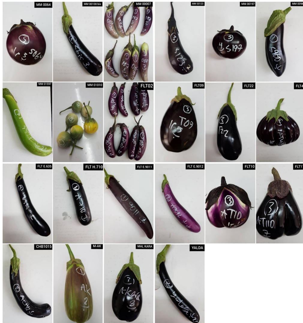
Figure 1. Fruits diversity of Solanum melongena accessions.

to MM 01010 and FLT46, respectively. Among the studied accessions, Chahboland (CHB1015) had longer fruit with an average length of 28.75 cm vs. MM01010 with 3 cm recorded the minimum fruit length. The accessions showed large differences in fruit weight, number of fruits per plant, yield, number of flowers per plant, fruit apical width, fruit central width and number of aerial lateral branches. A higher variance per character indicates a wider range of values and thus increases the possibility of