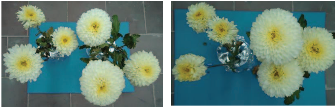
Figure 3. Comparison of SA 300 ppm and control treatments (right), SA 300 ppm and GCF commercial preservation solution (left) on the 12 th day from the start of the experiment (in each picture the right one is the SA treated flowers).

days compared to the control, respectively (Figure 1). On the other hand, in other quality traits such as petal water content, relative water content and fresh weight in day one and nine, flowers in GCF solution had a very poor quality (Figure 3). Petals were completely destroyed in 8 days and leaves all wilted. In salicylic acid treatments these qualities were held in an acceptable manner even until day 20 of the experiment. In general it seems that cut flowers placed in this solution are capable of absorbing water like other treatments but the major amount of the absorbed water is lost through transpiration. Therefore, significant weight and visual quality loss is obviously observed in this treatment.