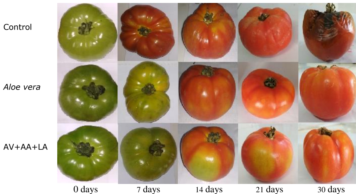
Figure 3. The gradual change of tomato throughout the storage time at 25-29°C and 82-84% RH over 30 days storage time.

combination with AA+LA in tomato. The results suggested that tomato samples coated with AV+AA+LA retarded postharvest ripening and maintained sample quality attributes most efficiently during storage at 25°C up to 30 th day as compared to the untreated control tomato that reached its maximum maturity in 14 days. This study indicated that AV with AA application could be used as a biochemical means for maintaining tomato quality and increasing its shelf life. Additional studies need to be conducted to understand the gaseous exchange of AV+LA+AA coating layer and develop new formulations to apply to different climacteric fruit and vegetables at low temperatures. Further research is needed to understand how coating influences microbial growth and thus affects the ripening process. Addition of A. vera with ascorbic acid in the edible coating as bio preservative, which contains antifungal and antioxidant compounds, provides a novel means to enhance safety and increase the postharvest storage life of tomato. It also ensures health and environmental protection