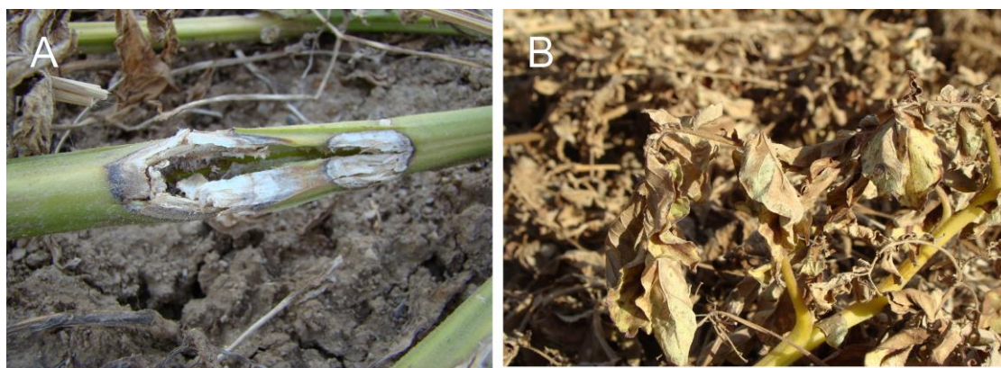
Figure 1. Symptoms of potato white mold caused by Sclerotinia sclerotiorum . The infection of lower parts of the plants can cause just a bleached lesion (A), or this infection can develop to kill the whole plant (B).

All tested biocontrol agents and chemical solutions were able to reduce markedly the carpogenic germination of the sclerotia (P<