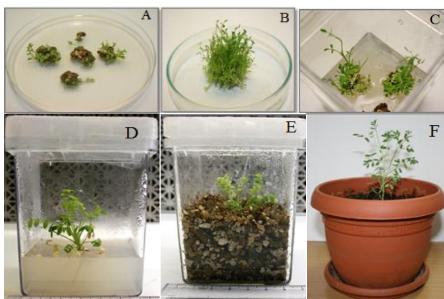
Figure 1. In vitro micropropagation of A. gymmolobus : Shoot regeneration from leaf explants containing 0.5 mg L -1 TDZ (A, B); shoot elongation on MS+0.5 mg L -1 GA 3 (C); root development on MS medium (D); rooted plants in vermiculite for acclimatization (E), and regenerated plant in plastic pot containing sterile soil under growth room conditions (F).

a Means within columns followed by the same letters are not significantly different (P > 0.05).