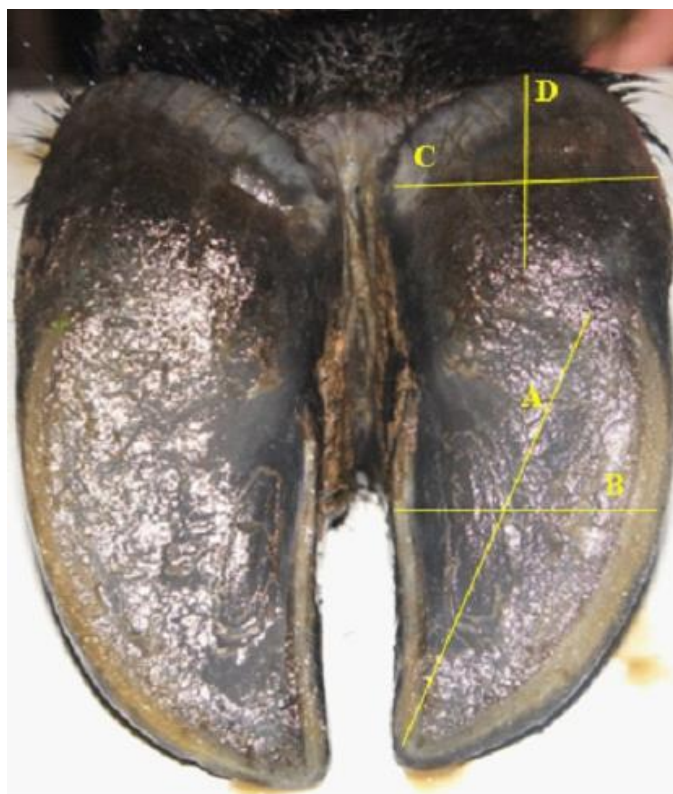
Captions: (A) Sole length; (B) Sole width; (C) Bulb width, (D) Bulb length.