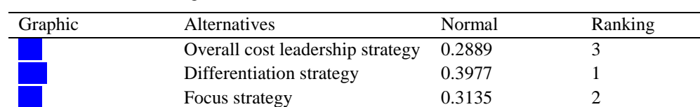
Table 7. Alternative rankings.