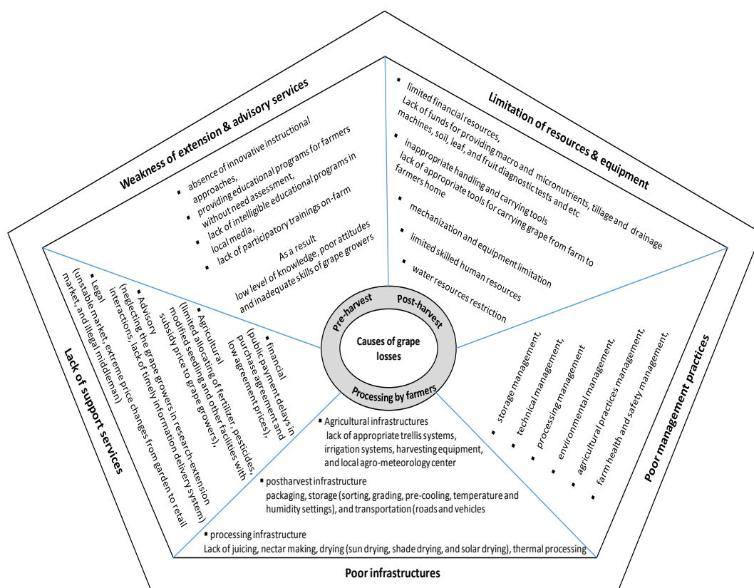
Figure1. Model of the main causes of grape losses.

derive from the absence of innovative instructional approaches, providing educational programs for farmers without requiring assessment, lack of intelligible educational programs in local media, and lack of participatory trainings on-farm. Nevertheless, researchers emphasized that extension and advisory service providers are responsible to meet needs of each group and training is vital in the process of reducing losses (Abass et al. , 2014; Hailu and Derbew, 2015; Midega et al. , 2016; Epeju, 2016). In addition, increasing farmers' technical know-how and training (Abass et al. , 2014), fitting technical training (Hailu and Derbew, 2015), educational innovation (Epeju, 2016), understanding local farmers' situations and needs (Midega et al. , 2016), providing information through local media (McNamara and Tata, 2015) could be aggravating factors.