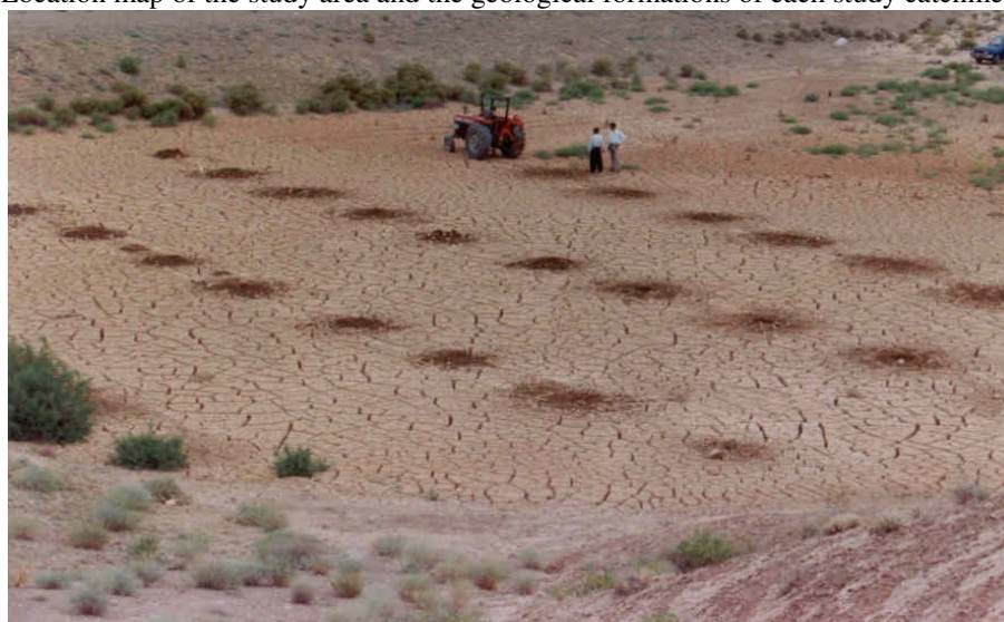
Figure 2. Some examples of the profile pits.