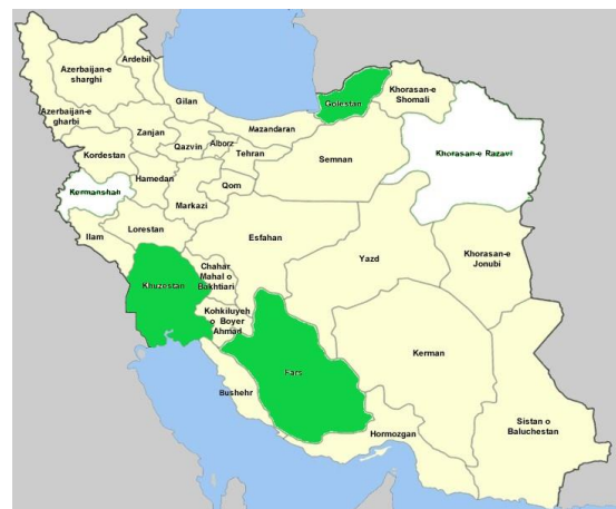
Figure 1. Map of Iran showing the research provinces.

Appropriate crop rotation is one of the primary principles of CA. Crop rotation and cropping pattern may be different based on climate conditions. Therefore, farmers collect information and knowledge to choose appropriate crop rotation from various sources. The results are shown in (Table 2 and Figure 2-a). It is seen that the pioneer farmers and CA project farmers have played the most important roles in knowledge and information dissemination about crop rotation among farmers. Based on the results, the pioneer farmers were the leader in selecting cropping pattern. The centrality, betweenness, and closeness degree of the pioneer farmers were the highest among all actors. The family members were the third main driver of crop rotation. The centrality, betweenness, and closeness degree of the family members were 23.48, 11.28, and 10.27, respectively. Also, the rural cooperatives had been referred to the least as a source of information by farmers. These results are consistent with the results of Solano et al. (2003), Hedjazi and Veisi (2007), Rehman et al. (2013), and Safi Cis et al. (2014). They stated that