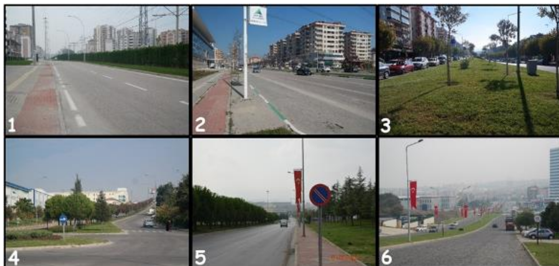
Figure 2. Bursa Nilüfer District Boulevards overview: (1) Uğur Mumcu Boulevard, (2) Ahmet Taner Kışlalı Boulevard, (3) Fatih Sultan Mehmet Boulevard, (4) Nilüfer Boulevard, (5) Atatürk Boulevard, and (6) 75. Yıl Boulevard.

Nilüfer Boulevard: The Nilüfer Boulevard located in the Nilüfer Industrial Zone intersects with Atatürk Boulevard. It is 1.10 km long.