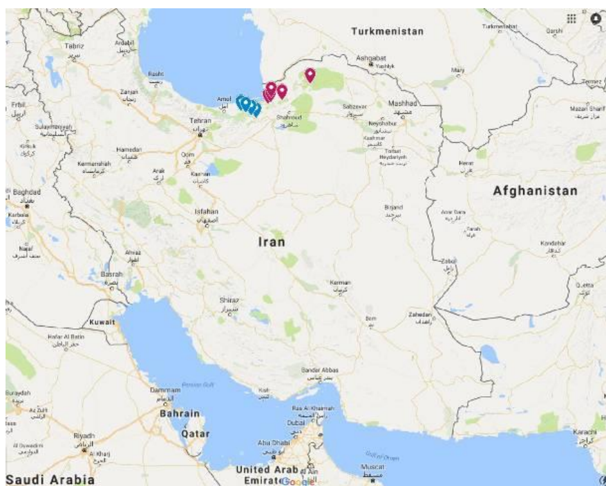
Figure 2. Map of Iran. Red and blue points indicate the study sites in Golestan and Mazandaran Provinces, respectively.