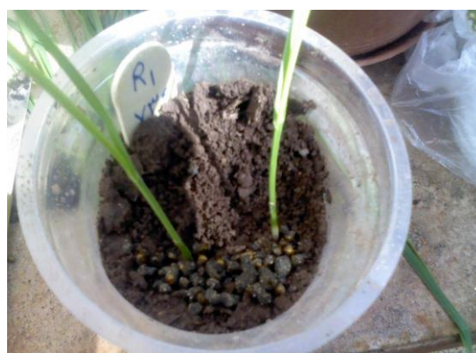
Figure 2. Inoculated on wheat seedlings.

ANOVA and logistic regression analyses were performed using MINITAB 14 statistical software. PLSD and mean comparison test was done by SAS statistical software.