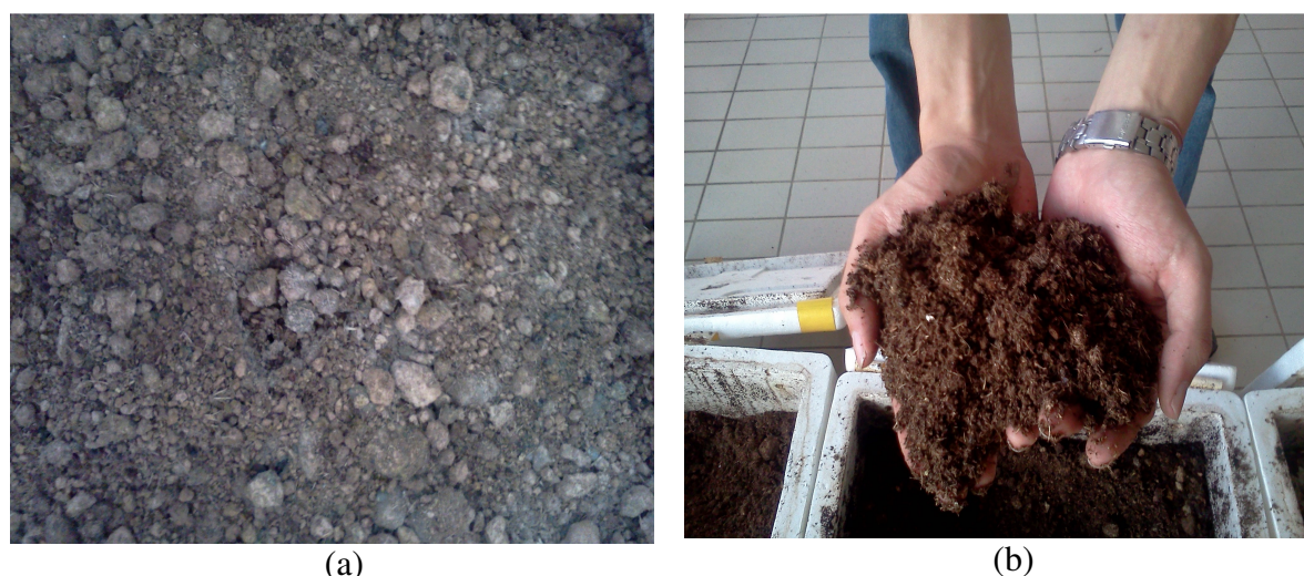
Figure 2. (a) Colour and texture of raw sago bagasse, and (b) Colour and texture of finished matured sago waste co-compost.

also used sago bagasse as feedstock but failed to achieve thermophilic stage during composting.