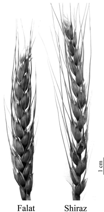
Figure 1. Spikes of Falat and Shiraz cultivars, which are different in spike compactness.

plot was 1 m 2 composed of four 0.5×0.5 m quadrates. Finally, the grain yield of each cultivar was determined by weighing the samples, and then total grain yield of the mixture was calculated by the summation of the two related values.