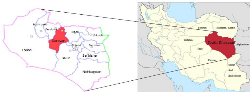
Figure 2. Map of the study area, (South Khorasan Provincial Government, 2016).

The DEA aims at measuring relative efficiency of Decision-Making Units (DMU) that produce similar products at different quantities using different quantities of similar inputs (Pahlavan et al. , 2012). It includes two distinct models from Charnes, Cooper and Rhodes (1978) and