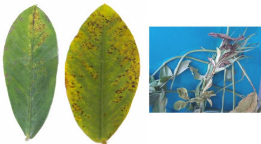
Figure 1. Peanut leaves and a plant showing symptoms of PeMoV. Chlorotic areas progressing to necrotic spots on the leaves and stem are shown.

In addition to P. hybrida and N. benthamiana , crude extracts of infected peanut leaves were inoculated to a limited