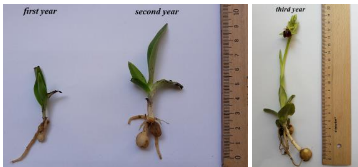
Figure 1. Development of possibly seed-derived O. sphegodes subsp. mammosa individuals in the first, second, and third year.

removing their tubers for morphological observations. Interestingly, they observed that the individuals re-produced new small tubers after tarriance in laboratory. Similarly, Tutar et al. (2012) observed the regrowth of Orchis sancta and Serapias vomeracea individuals producing new small tubers after removing their tubers. Kreutz and Çolak (2009) also reported that regrowth could be observed in re-planted orchids of which fresh tubers were removed.