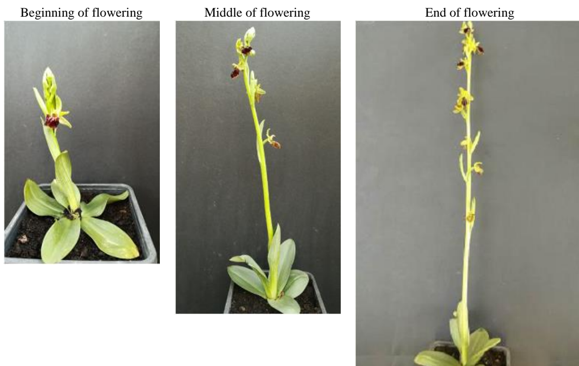
Figure 3. Photos of different O. sphegodes subsp. mammosa orchids at the beginning, middle and end of flowering.