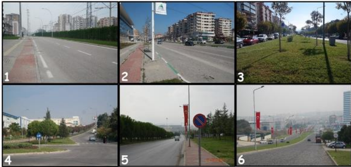
Figure 2. Bursa Nilüfer District Boulevards overview: (1) Uğur Mumcu Boulevard, (2) Ahmet Taner Kışlalı Boulevard, (3) Fatih Sultan Mehmet Boulevard, (4) Nilüfer Boulevard, (5) Atatürk Boulevard, and (6) 75. Yıl Boulevard.

Nilüfer Boulevard: The Nilüfer Boulevard located in the Nilüfer Industrial Zone intersects with Atatürk Boulevard. It is 1.10 km long.