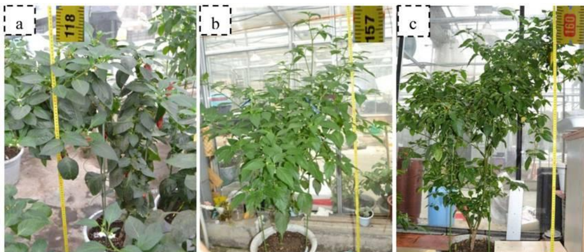
Figure 1. Whole plant height and attitude of cultivated pepper, wild relative and interspecific hybrid F 1 . (a) Cultivated pepper ( Capsium annuum ) 007EA, (b) Interspecific hybrid F 1 ( C. annuum × C. frutescens ) and (c) Wild relative ( C. frutescens ) P1512.

morphological characteristics, interspecific hybrid was closer to the wild species compared to the cultivated species. These traits included plant height, the internode length, leaf length, leaf width, leaf petiole length, petal number, corolla diameter, stamens length, fruit weight, fruit length, and fruit diameter (Supplemental Table 2; Figure 1). These traits had smaller values in wild species and interspecific hybrid, with the exception of two traits (plant height, the internode length) that had higher average values (Supplemental Table 2; Figure 1). Furthermore, we also found that interspecific hybrids were extremely similar to the wild species in the following four traits including flower color, pedicel position, leaf and fruit shape. On the contrary, interspecific hybrids were found closer to cultivated species in the fruit position. Moreover, purple anthocyanin accumulated at the nodal positions in the cultivated species and interspecific hybrids, except for the wild species (Supplemental Table 1). In addition, while the interspecific hybrids had an intermediate value in flower size, the traits related to the pedicel and style length had much higher values in the interspecific hybrids compared to the parental lines (Supplemental Table 2; Figure 2). Regarding seeds, there were many seeds with the embryo abortion in