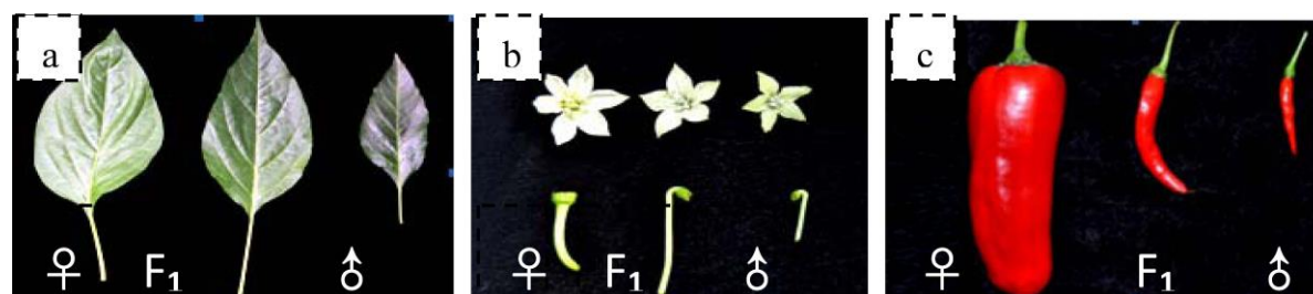
Figure 2. Comparison of leaf, flower and fruit among cultivated pepper ( Capsium annuum -007EA), wild relative ( C. frutescens -P1512) and interspecific hybrid F 1 . (a) Leaf, (b) Flower and (c) Fruit. (♀: C. annuum , ♂: C. frutescens ).