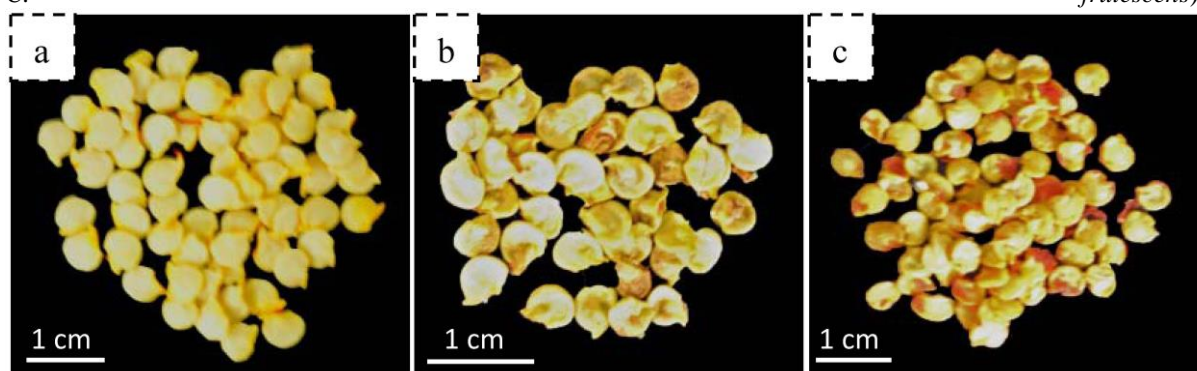
Figure 3. Comparison of seeds among cultivated pepper, wild relative and interspecific hybrid F 1 . (a) Cultivated pepper ( Capsium annuum ) 007EA, (b) Interspecific hybrid F 1 ( C. annuum × C. frutescens ) and (c) Wild relative ( C. frutescens ) P1512.

the interspecific hybrids, but parental lines showed normal appearances (Supplemental Table 2; Figure 3).