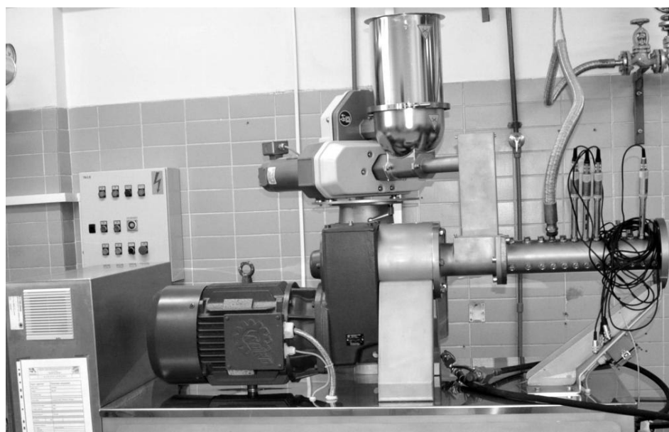
Figure 1. Extruder used in the experiment.

Moisture content of the samples was determined using gravimetric AOAC Method 950.46, also known as “oven dry” method, and crude ash was done using standard AOAC Method 942.05. For determination of crude protein, Kjeldahl Method was used according to AOAC 978.04 Method, crude fibres were determined by AOAC 978.10 Method (AOAC, 2000), and total fat content by Soxhlet procedure, as explained in AOCS Method Ba 3-38 (AOCS, 2001).