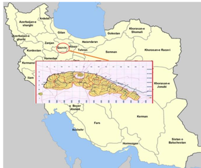
Figure 1. Study area: Qazvin Plain.

Figure 1 shows the location of study area (Qazvin Plain) in north of Iran. The needed water of Qazvin plain is provided by Taleghan dam. Water is released in no special order and is highly influenced by the urban demands of cities of Tehran and Karaj (high population concentration and extreme industrial activities) and climate-related extreme events (hydrological droughts). For the Qazvin region, urban population growth, low level of water productivity, inefficient allocation of water, and inappropriate cropping pattern are considered as major problems. In fact, the provision of adequate amount of water for urban consumption has been a challenging factor for the region. In order to solve this problem, various studies, based on technical and engineering approaches, have been conducted. However, due to the multifaceted and interdisciplinary nature of problems and issues regarding water resources (Serageldin, 1995), solution of problems in Qazvin plain requires consideration of economic, social, and