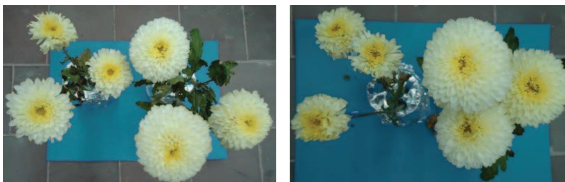
Figure 3. Comparison of SA 300 ppm and control treatments (right), SA 300 ppm and GCF commercial preservation solution (left) on the 12 th day from the start of the experiment (in each picture the right one is the SA treated flowers).

days compared to the control, respectively (Figure 1). On the other hand, in other quality traits such as petal water content, relative water content and fresh weight in day one and nine, flowers in GCF solution had a very poor quality (Figure 3). Petals were completely destroyed in 8 days and leaves all wilted. In salicylic acid treatments these qualities were held in an acceptable manner even until day 20 of the experiment. In general it seems that cut flowers placed in this solution are capable of absorbing water like other treatments but the major amount of the absorbed water is lost through transpiration. Therefore, significant weight and visual quality loss is obviously observed in this treatment.