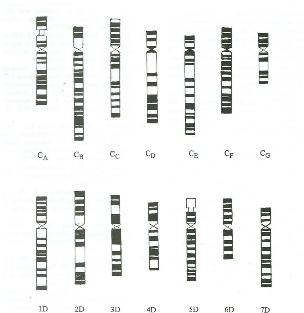
Figure 3. Idiogram of Ae. cylindrica , (genomes C and D with acetocarmine bands shown in black).

For a reliable karyotype analysis, the cells must be flat, in a single layer, but yet complete, and often the last need cannot be realized with the first two having been met. Here a serious problem arises when the cell is flattened, the chromosomes are stretched, and the stretching is not homogeneous. Sybenga (1992) noted that some chromosome arms stretch relatively more than others, which causes intrinsic differences between