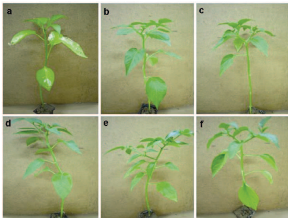
Figure 3. In vivo antifungal activity of the essential oil of M. liliflora against plant pathogenic fungus of Phytophthora capsici KACC 40157 on greenhouse grown pepper plants. a: Treated with pathogen ( P. capsici KACC 40157) in vehicle; b: No treatment (normal control); c: Treated with vehicle (0.5% DMSO+0.1% Tween-20 in water); d, e, f: Treated with pathogen and different concentrations of essential oil ( 1,000 , 500 and 250 \mu\text{g mL}^{-1} , respectively) in vehicle.

a Normal control plant without treatment or vehicle only having no disease symptoms; b Vehicle solution (0.5% DMSO+0.1% Tween-20 in water); c Positive control: Oligochitosan; d Essential oil, e Treatment in vehicle solution.