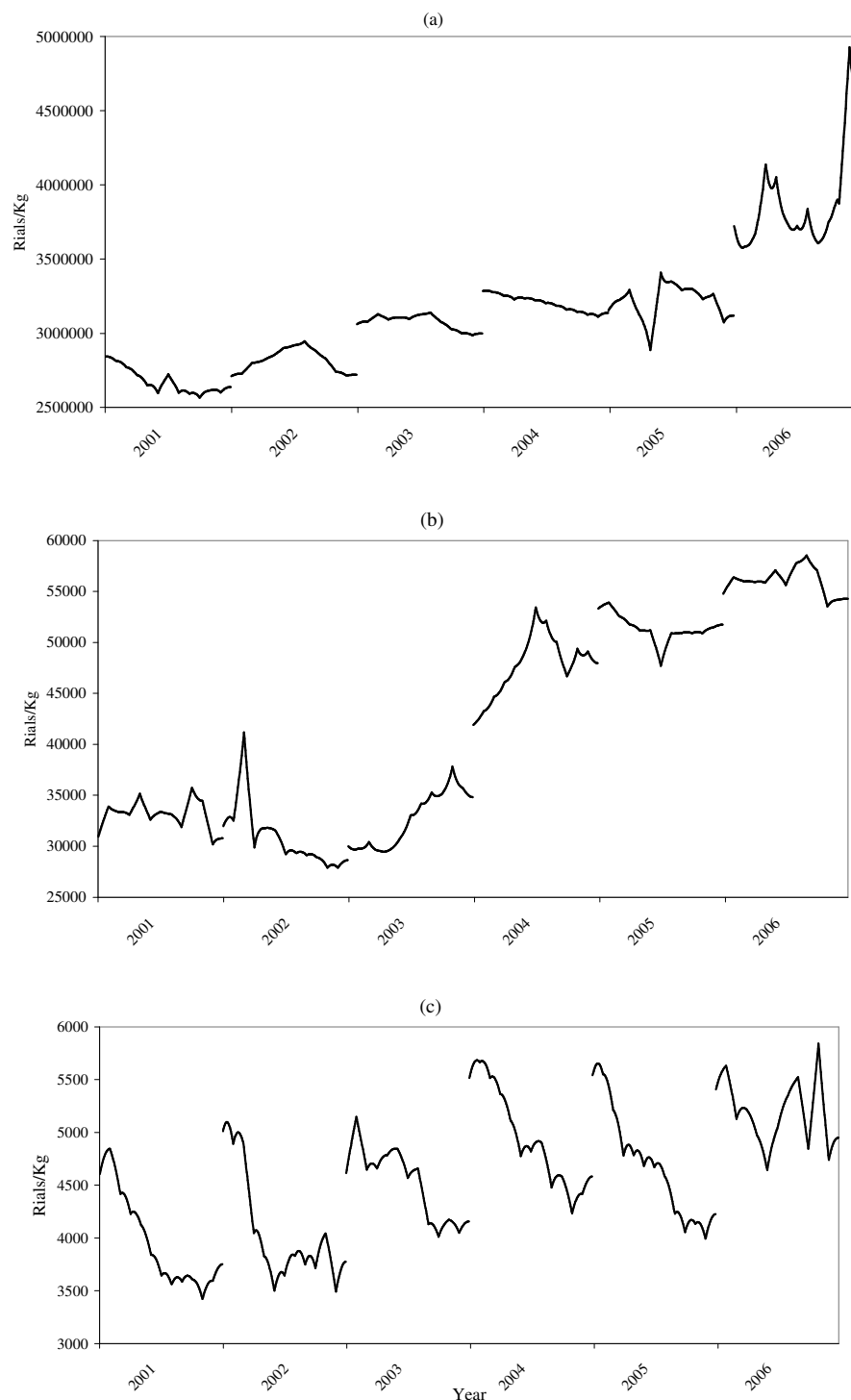
Figure 3a, b and c. The simulated daily future prices of, (a) saffron with 9 working days, (b) pistachio with 5 working day and (c) rice with 21 working day expiration interval during 2001-2006.