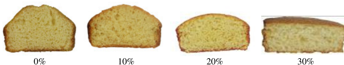
Figure 1. Cross-section of the cakes containing different levels of resistant starch.

Table 1 shows the results of replacing flour with RS. Replacement of flour with RS caused an increase in cake density from 0.376 to 0.406 g cm -3 and a decrease in the volume from 552.70 to 512.10 cm 3 . The extent of the influence was correlated with the wheat flour replacement level. Early gelatinization of starch is the key factor in cake volume and quality (Wilderjans et al. , 2010). RS is not only resistant to digestion but also to gelatinization in most food processing conditions and plays the role of a filler and will not gelatinize readily during baking (Korus et al. , 2009; Wilderjans et al. , 2010). Thus, inclusion of RS in cake formulation may cause a decrease in cake volume. The decrease in the cake volume is also related to the decrease in batter density and consistency as discussed earlier. Figure 1 shows the cross-section of the cakes