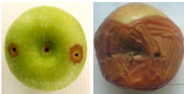
Figure 1. Lesions produced in cold storage in apple cv. Granny Smith (left) vs. Mashhad (right) four months past of inoculation.

year, differences between the years were varied. Similar variations for different years have also been reported by Spotts et al. (1999) and could be attributed to many such uncontrolled factors as different climates and harvest maturity standards pertaining to each year (Valiuškaitė et al. , 2006; Torres et al. , 2003). A comparison of blue mold resistance in Fuji, Granny Smith and Golden Delicious by Spotts et al. (1999) indicated that Fuji and Golden Delicious were moderately susceptible while Granny Smith moderately resistant in line with the present study's results. In another study, 83 accessions of Kazak origin showed differences in decay resistance (Janisiewicz et al. , 2008), but none of the accessions in that study have been included herein. Many biochemical factors influence resistance of apple cortical tissue to decay, including glycoprotein endopolygalacturonase inhibitors (Brown, 1984), benzoic acid (Seng et al. , 1985), H_2O_2 and its associated metabolism (Torres et al. , 2003) as well as peroxidase activity, especially through its action on lignification (Valentines et al. , 2005).