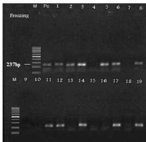
Figure 1. Detection of GVA by RT-PCR assay using primers GVA-H7038 and GVA-C7275 on V. vinifera cv. Black plantlets regenerated from cryotherapy-treated shoot tips. Lane M, molecular weight marker (GeneRuler™ 100bp DNA ladder, Fermentas); lane PC, infected plantlets not treated; lanes 1–19; plantlets regenerated from cryotherapy-treated shoot tips of GVA-infected grapevine.

After two months, generated plants were tested for the presence of virus using RT-PCR technique. In the 10 minutes exposure experiments, 100% (control), 83% (10 mA),