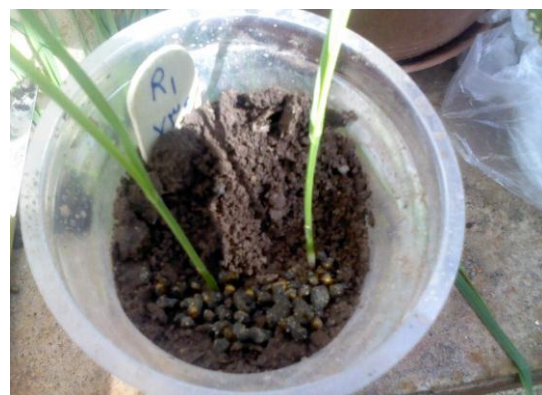
Figure 2. Inoculated on wheat seedlings.

ANOVA and logistic regression analyses were performed using MINITAB 14 statistical software. PLSD and mean comparison test was done by SAS statistical software.