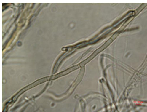
Figure 1. Middle simple hyphopodia of Ggt that have formed aggregation.

The selective medium for fungal culturing was Potato Dextrose Agar (PDA) containing streptomycin (0.03 gram in 1,000 cc PDA).