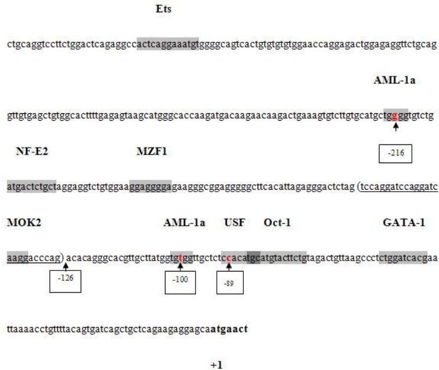
Figure 3. Sequence of the MC1R-promoter, identified genetic variations (red, bold) and potential transcription factor binding sites (grey boxes). The parenthesis shows the 26 nucleotide insertion at position -126 relative to the start codon.