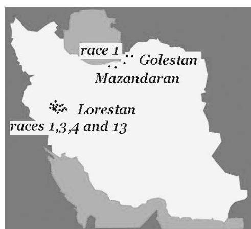
Figure 2. Distribution of the isolates and races in Lorestan, Mazandaran and Golestan Provinces.

About 22 isolates of P. sojae from 35 different farms country-wide were obtained during this research. The reactions of the isolates on the differential sets using the hypocotyls inoculation method are shown in