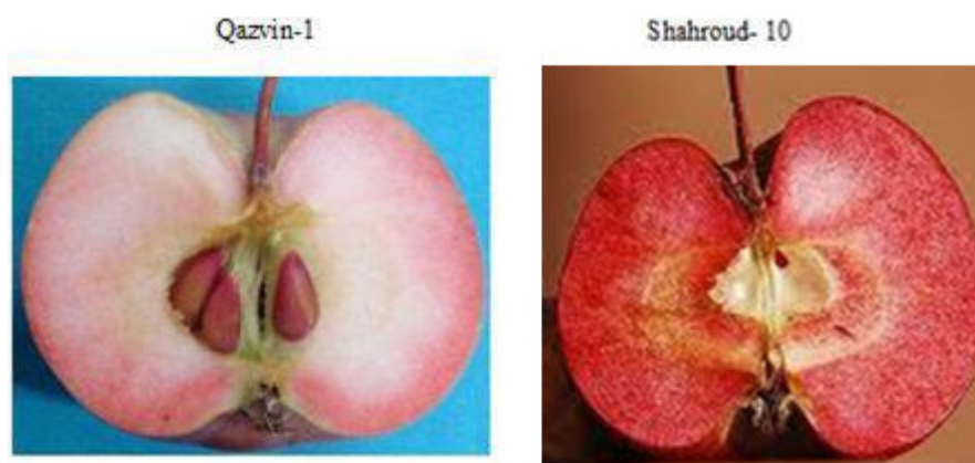
Figure 3. Two genotypes of Iranian red- fleshed apple.

important crop stresses (White and Walker, 1997). The findings of genetic diversity can be used in breeding programs for increasing the genetic variation in base populations by crossing cultivars with a high level of genetic distance as well as for the introgression of exotic germplasm. To be most efficiently managed and effectively utilized, germplasm must be well characterized. But, the number of these characteristics is limited, they are unstable, and do not always distinguish between closely related cultivars (Konarev., 2000). Hence, genetic diversity estimations based on molecular marker data yield a minimum genetic distance which indicates that two cultivars are not essentially derived (Lefebvre et al. , 2001). This analysis will be useful in the selection of parental genotypes for mapping populations and breeding programs. Extensive research has indicated that the number of DNA markers used for genetic studies in plants varies with the total number of genotypes assessed (Thottapilly et al. , 1996). Microsatellite markers or SSRs (Simple Sequence Repeats) are one of the most informative and appropriate markers for plant genome analysis (Perera et al. , 2000). The valuable attributes of all SSR markers are co-dominance, technical and analytical simplicity, sensitivity, and uniform dispersion throughout genome with a frequency of every 10^3 Kb. Thus, SSR markers are ideal tools for many genetic applications (Moyib et al. , 2007). These