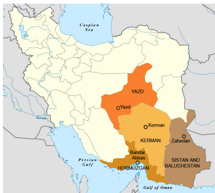
Figure 1. Map of Iran showing the provinces where the alfalfa crop was surveyed for viruses.

Samples were collected from different regions of four alfalfa producing provinces of southeast and central Iran (Figure 1). Surveys were undertaken between May 2009 and March 2011, depending on the vegetative growth in each region. Two groups of leaf samples were collected from plants in each field: (1) four to 5 symptomatic plants exhibiting mosaic, green vein banding, mild to severe mottling and leaf malformation, and (2) five to 6 plants randomly sampled irrespective of their symptoms. Young leaves from symptomatic or asymptomatic plants were stored in plastic bags and transported to the laboratory in an ice box. Samples were kept at 4°C until tested initially by enzyme-linked immunosorbent assay (ELISA), followed by the RT-PCR assay. Virus incidence in each field was expressed as the percentage of