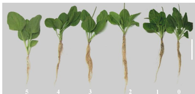
Figure 2. Comparison between the control and treated plants in growth parameters. Treatment conditions: 1% algal extracts (5.0 g fresh algal material in 500 mL of distilled water) were sprayed on soil of treated pots; (0) Plant treated by Nostoc spongiaeforme var. tenu e ISB63; (1) Plant treated by Nostoc spongiaeforme var. tenu e ISB64; (2) Plant treated by Anabaena vaginicola ISB42; (3) Plant treated by Nostoc spongiaeforme var. tenu e ISB65; (4) Plant treated by Cylindrospermum michailovskoense ISB45, and (5) Plant irrigated by distilled water (Control plant) (Bar= 10 cm).