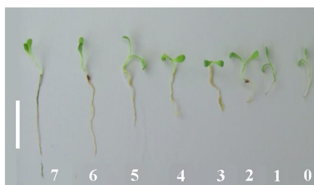
Figure 1. Comparison between the control and treated seedlings in growth parameters. Treatment conditions: 1% algal extracts (1.0 g fresh algal material in 100 mL of distilled water), (0) Control seedling; (1) Seedling treated by Nostoc edaphicum ISB89; (2) Seedling treated by Cylindrospermum muscicola ISB88; (3) Seedling treated by Cylindrospermum michailovskoense ISB45; (4) Seedling treated by Nostoc spongiaeforme var. tenu e ISB65; (5) Seedling treated by Nostoc spongiaeforme var. tenu e ISB64; (6) Seedling treated by Nostoc spongiaeforme var. tenu e ISB63, (7) Seedling treated by Anabaena vaginicola ISB42 (Bar= 1 cm).