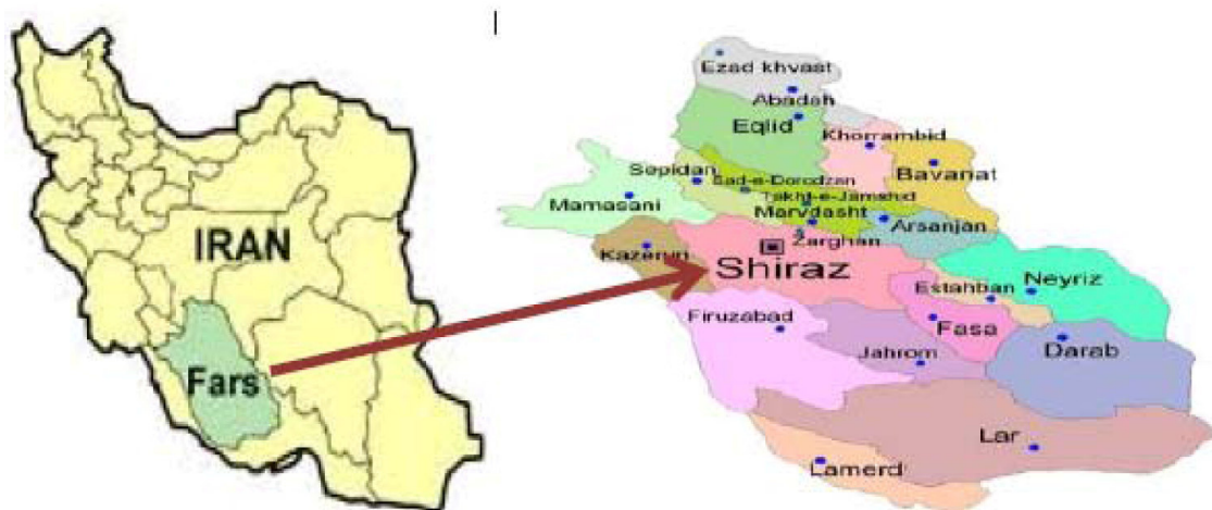
Figure 2. Location of the study area.

Face validity of questionnaire was obtained through a panel of experts and reliability was obtained through pilot testing