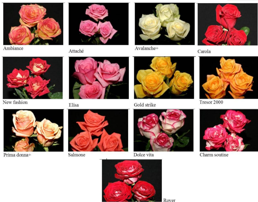
Figure 1. Thirteen rose cultivars cultivated at Ceará-Brazil, selected as candidates for edible flowers.

The ash determination was made by gravimetry after incineration at 600°C until constant weight according to IAL (2005).