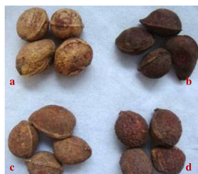
Figure 2. Bambara groundnut landraces assorted by dry pod colour: (a) Yellowish (211-37) (Landrace name); (b) Purple (25-1); (c) Brown (011-28), and (d) Reddish brown (43-2).