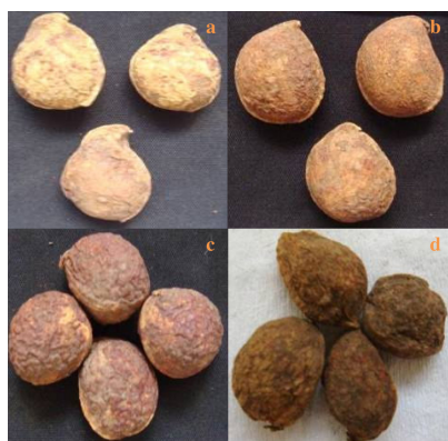
Figure 3. Bambara groundnut landraces assorted by dry pod texture: (a) Smooth (211-68) (Landrace name); (b) Little grooves (M09-3); (c) Much grooves (N211-12), and (d) Much folded (N211-1).