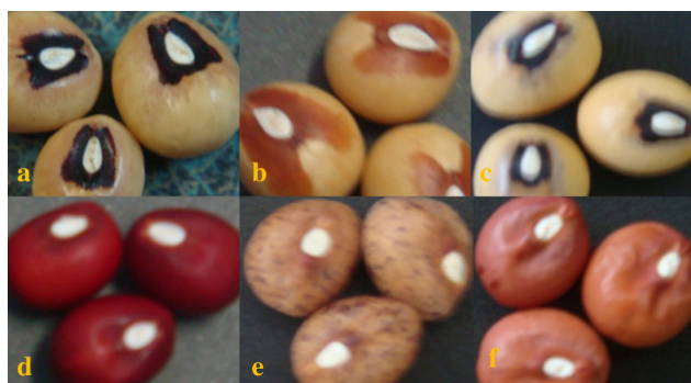
Figure 4. Description of the presence and absence of eye and its pattern on the seeds of some Bambara groundnut landraces: (a) Cream with black-broad eye (211-45) (Landrace name); (b) Cream with red-butterfly eye (211-75); (c) Cream with black thin eye (TV-96); (d) Red with plain eye (M 08-3); (e) Light-brown with black spots and plain eye (211-84), and (f) Dark-brown with plain eye (211-86).