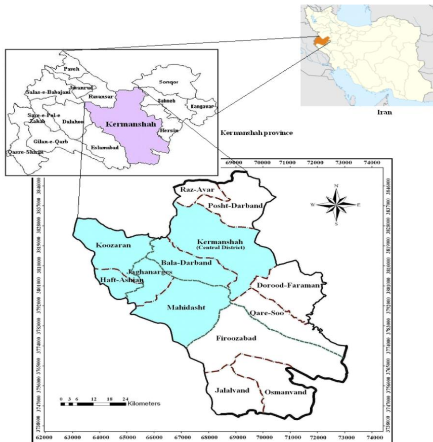
Figure 2. The study area.

The population of the study comprised the farmers who lived in Kermanshah Township containing six rural districts, i.e. Kermanshah (central district), Bala-Darband, Mahidasht, Jaghanarges, Haft-Ashian and Koozaran (Figure 2). The population of the study included 11200 farmers, with some farmers trained to select canola for planting. Using stratified random sampling method and Bartlett et al. (2001) table of sampling, a total of 212 farmers