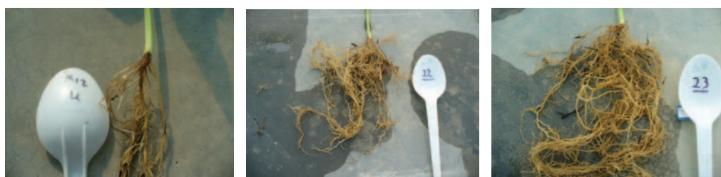
Figure 2. The comparison between wild type and avr- mutants. K12: Wild type isolate, 22 and 23: Avr-mutant isolates.

In this experiment, three concentrations of avr-M23 spores ( 10^3 , 10^6 and 10^9 conidia/ml) were evaluated for their ability to suppress Fusarium root rot of bean plants, grown in naturally infested soils in the field 110 days after sowing. Percentages of root rot in seeds colonized with M23 at concentrations of 10^6 and 10^9 conidia ml -1 were 39.5% and 38.8%, respectively whereas it was 67.3% in the control. In contrast, the percentage of root rot at the concentration of 10^3 conidia ml -1 was not significantly lower than that of the control (59.6% compared to 67.3%). Results