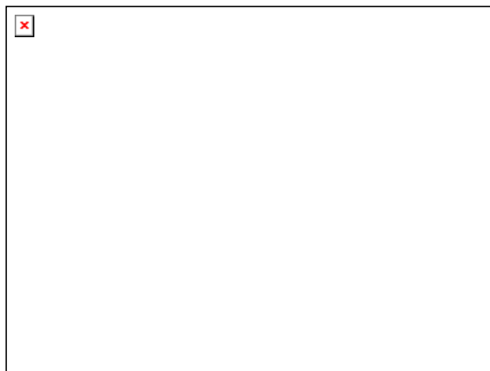
Figure 1. Changes in external (a) and cross-sectional view (b) of oocytes during 17, 20-dihydroxy-4-pregnen-3-one-induced maturation.